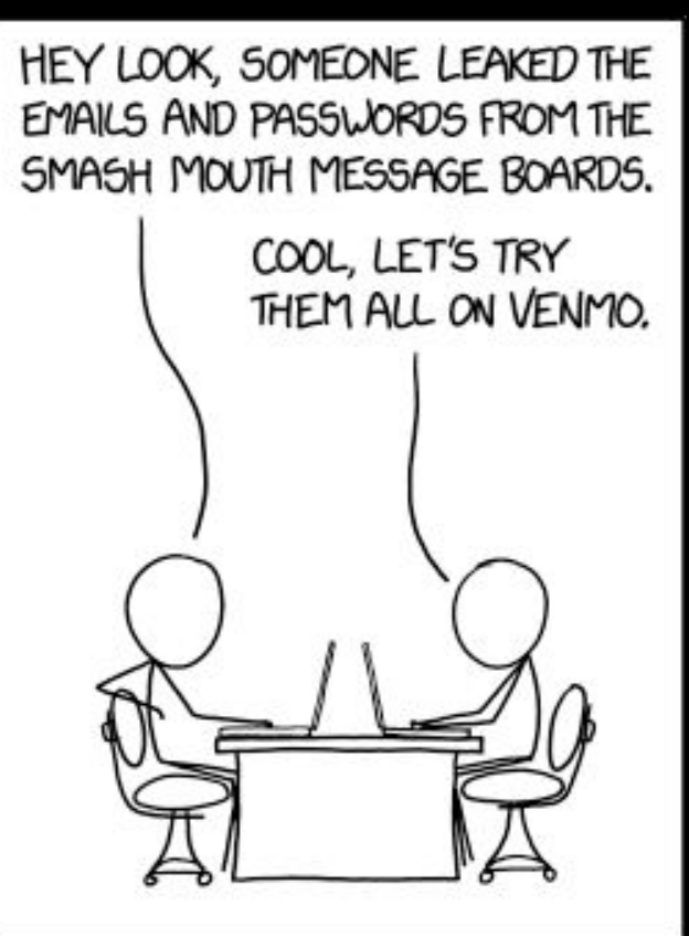
HOW IT ACTUALLY WORKS